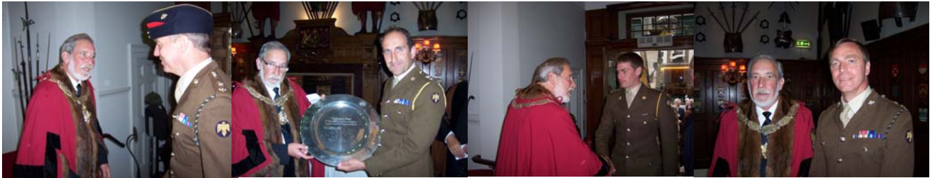
Reception for the Royal Anglian Regiment at Armourer's Hall and Presentation of the Poulterers Plate. 10th June 2010.

At the Midsummer Court lunch in June we hosted 80 officers and men of the Royal Anglian Regiment, just back from Afghanistan. This event was greatly enjoyed by both soldiers and liverymen.