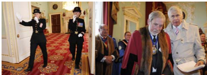
JAILED AND BAILED The Master being apprehended and transported to the Tower

Another highlight came when I was "jailed and bailed" at the Tower of London in aid of the Red Cross. Pam successfully raised over £1000 bail in order to secure my release from the Tower.