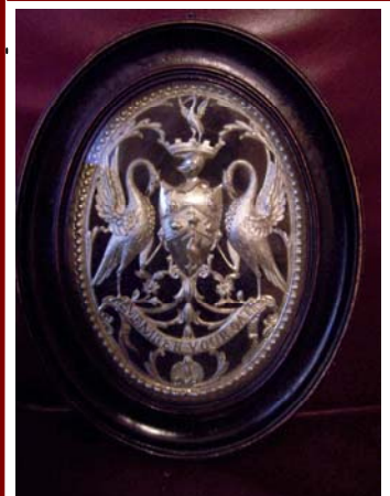
The Poulters' Arms mounted in silver