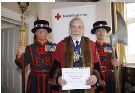
Prisoner No. 183201

Many tourists were very mystified and took lots of photographs as we were marched through the grounds of the Tower, robed with "ball and chain" attached!