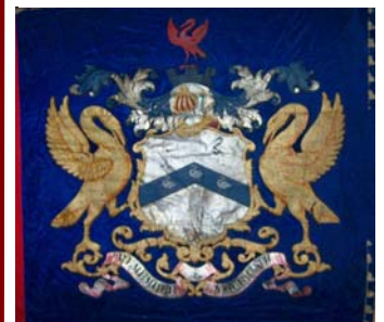
The Poulters Banner