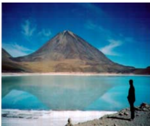
Past Master Richard Link at Lagune Verde Bolivia

Volcanic deserts, jungle rivers and cloud forest areas near Quito- all have their own interest and climate - and easy to visit by bus - have joined up with many interesting