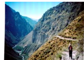
Colca Canyon Peru

Good stargazing from the deck at night-southern cross with the great bear -south and north. On Tuesday I set out on my journey south - lots of ideas of what I want to see - look at the map. I should be travelling by bus from Quito to the Atacama desert in northern Chile before turning up into Bolivia and then on North to Titicaca and Cusco-will then walk the Inca Trail.